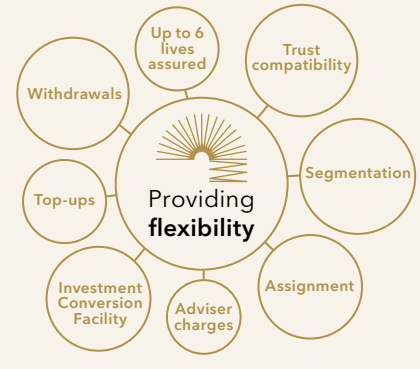
now and in the future

Access to a wider range of assets not available through a conventional bond, such as stocks and shares