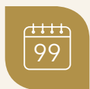
Generational tax planning