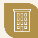
Discretionary managed product

Giving you the options to build your client's wrapper , to suit their needs