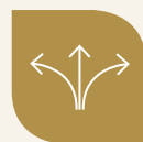
Wider range of assets