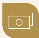
Supplement an income